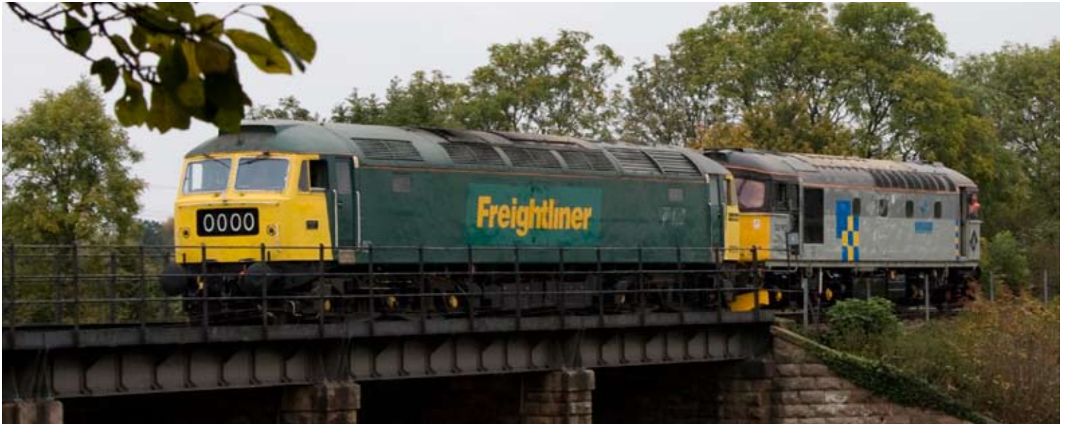
Above: One of the stars of the Nene Valley Autumn Diesel Gala was Class 47 270 seen here with 33063 at Wansford. Class47 Below: Looking very authentic and sounding excellent was the Class 56 at this years Nene Valley Autumn Diesel Gala.