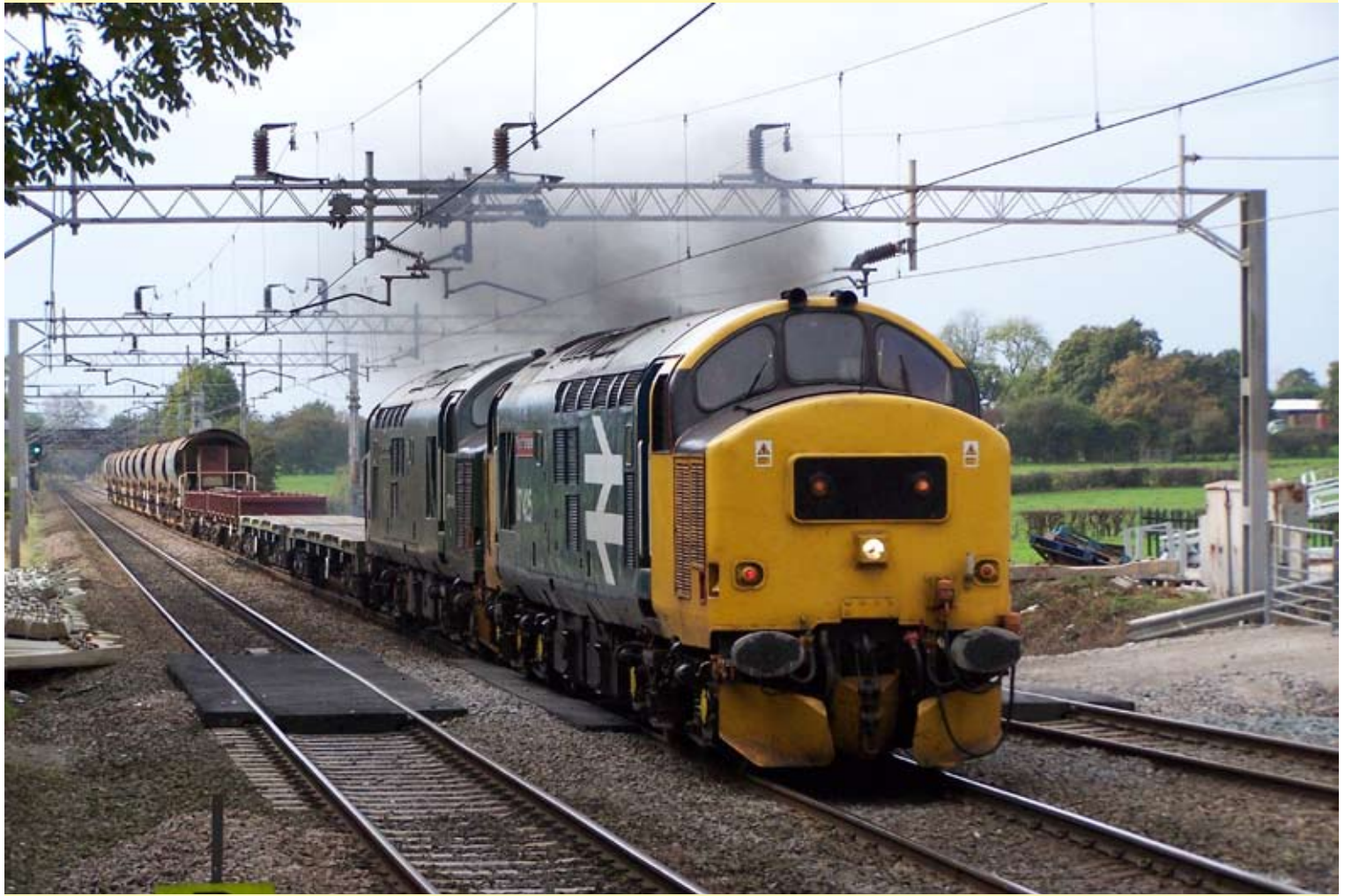
Above: Making a welcome return in October, 37425+37411 passing through Acton Bridge on the 15th with an Edge Hill - Crewe engineers. The pair had only just started working off Warrington after being reinstated.