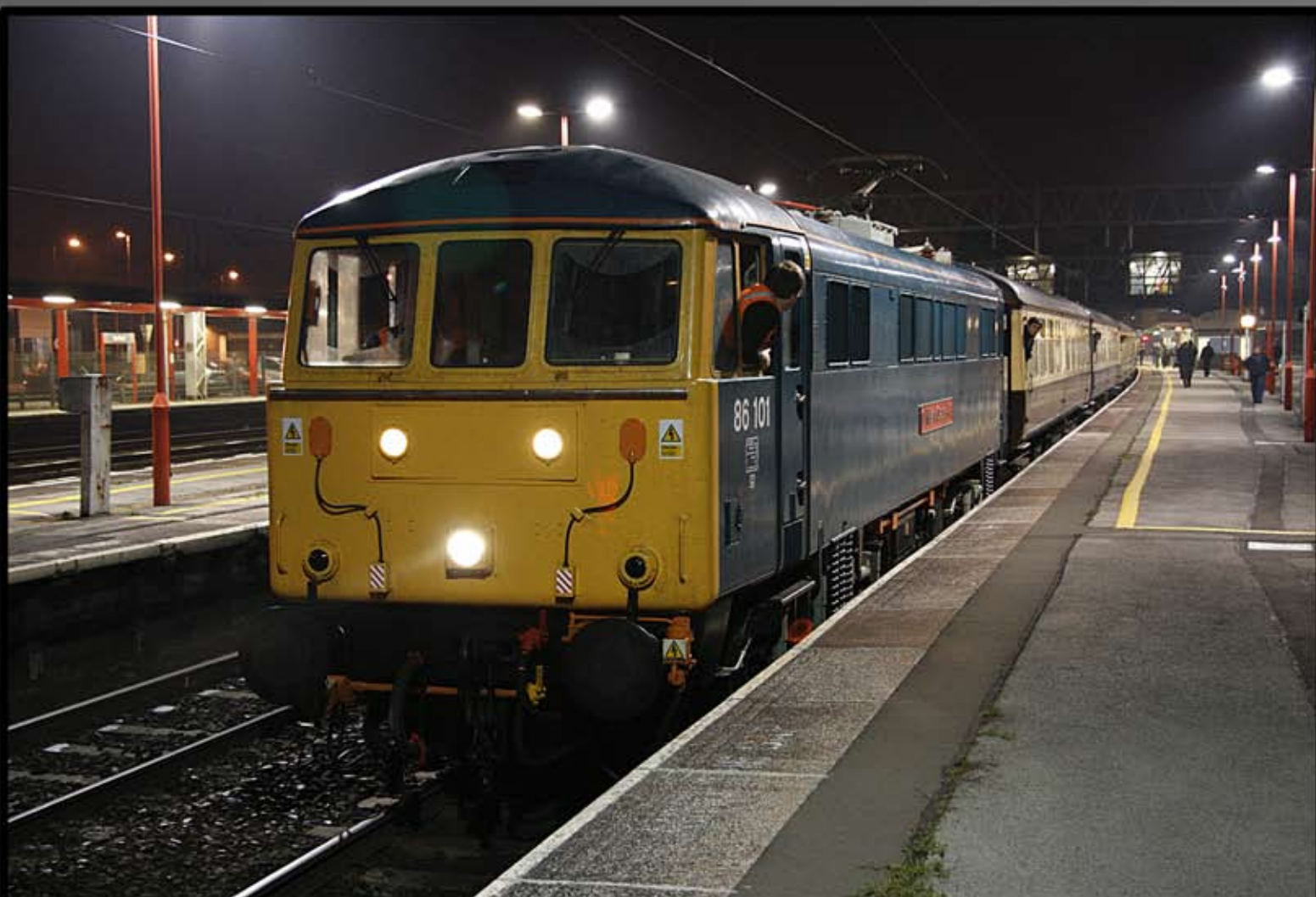
Above 86101 is seen at Stafford awaiting departure for Crewe on the return on the Atomic Harbour-master. You could have almost mistaken it for a scene a few years ago if it wasn't for the livery of the coaches.