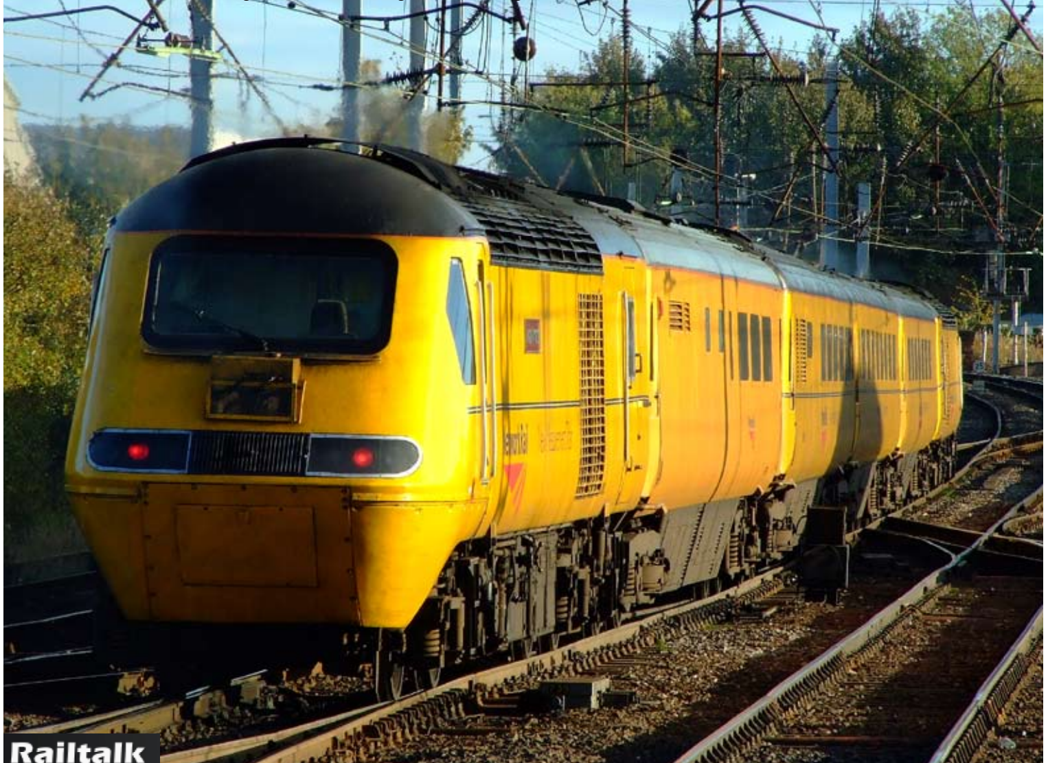
Below: 43 062 and with 43 013 leading, this is the late running 11.19 1Q92 Glasgow Central - Crewe, New Measurement Train at Carlisle. Jonathan McGurk