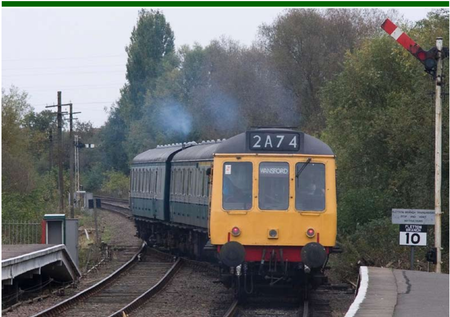
Above: Resident ex-Thames Trains DMU still retains it's original interior and still has authentic rattles, Nene Valley Autumn Diesel Gala. Class47 Below: Taking a rest from mainline duties, 50049 appeared at the Severn Valley Diesel Gala in October.