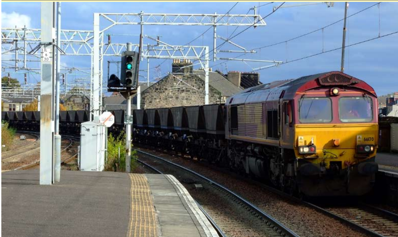
Top: Class 66 170 is seen passing through Paisley Gilmour Street Station working the 11.09 6J12 Longannet P.S. (Power Station) - Hunterston Empty M.G.R. Train, 13th October. Jonathan McGurk