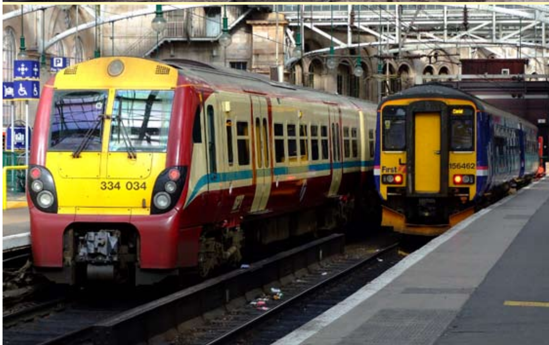
Middle: 334 034 is getting prepared to work the 12.25 1G61 Glasgow Central High Level - Gourock Service, while 156 462 is preparing to work the 12.08 2D01 Glasgow Central High Level - Paisley Canal Service on the 4th October.