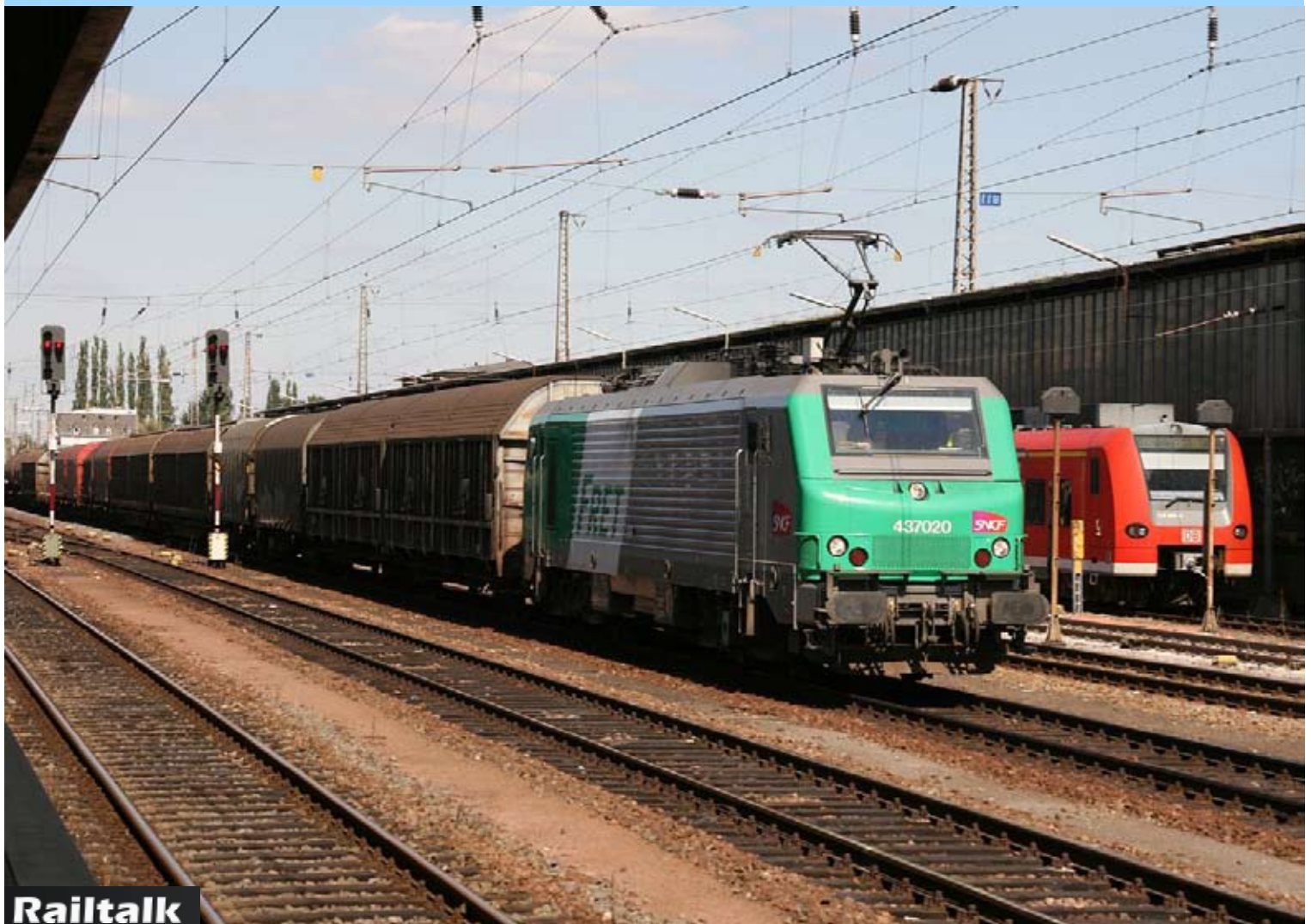
Above: VT267+VT255 both is Vectus Livery and looking rather smart are seen here at Trier on the 24th August. Brian Battersby Below: SNCF "Fret" 437020 passes through Trier on the 30th August. Brian Battersby