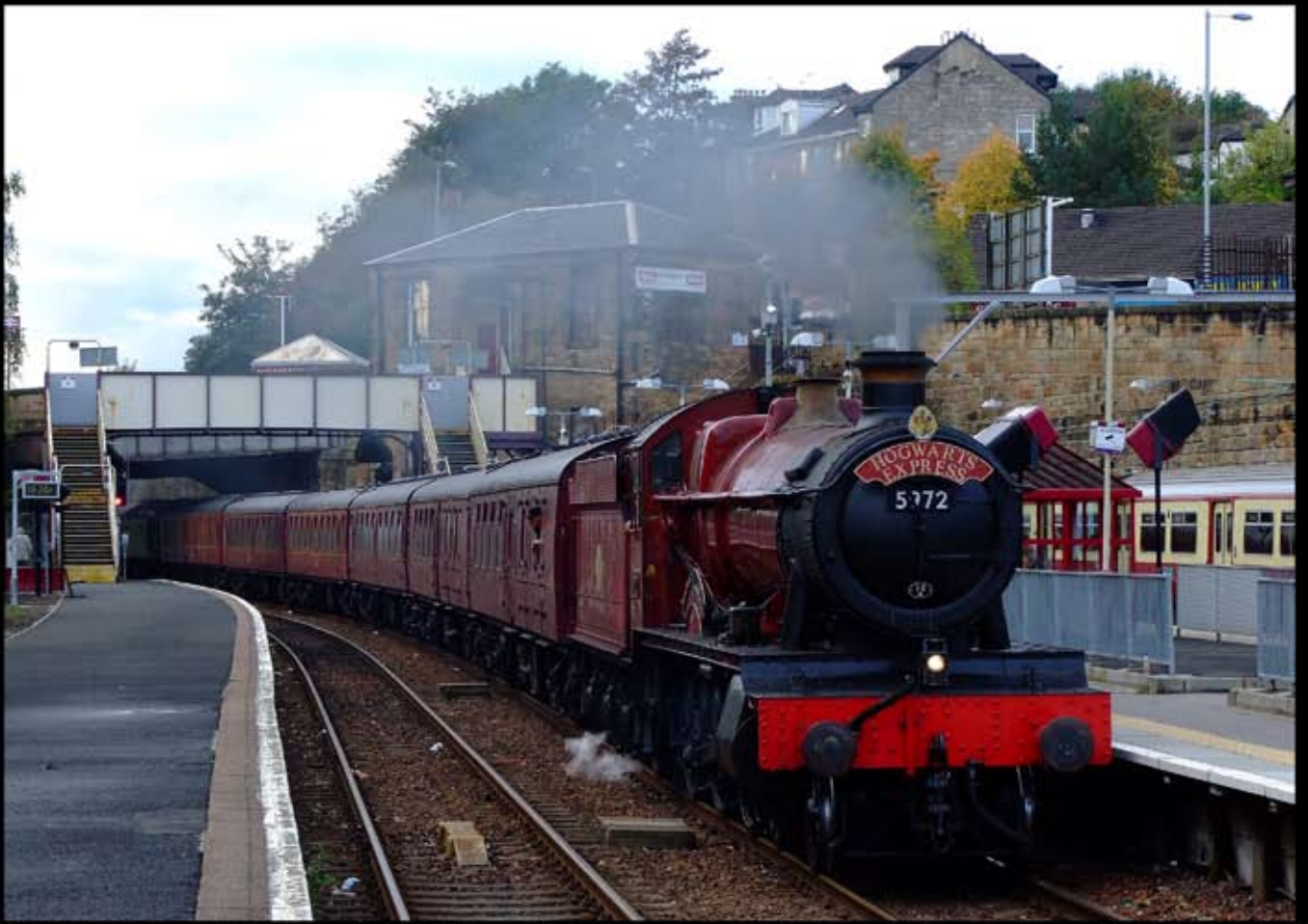
Above GWR Hall Class 4-6-0 no. 5972 Olton Hall passes Springburn whilst working the 08.10 5Z72 Fort William Yd. - Carnforth