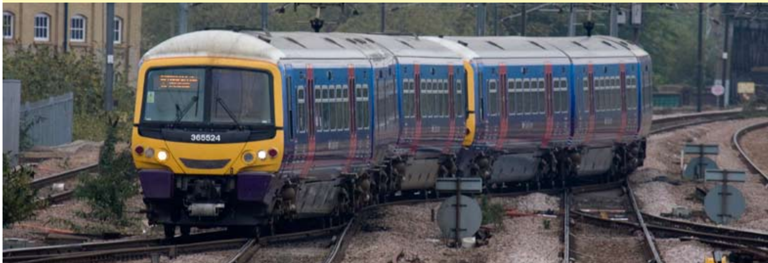
Top: With the speeding up of the eradication of the Network South East livery, the First Capital Connect liveried Class 365's are the norm at Peterborough, working the semi-fasts to London. 365524 is seen here approaching Peterborough on the 6th October. Class47