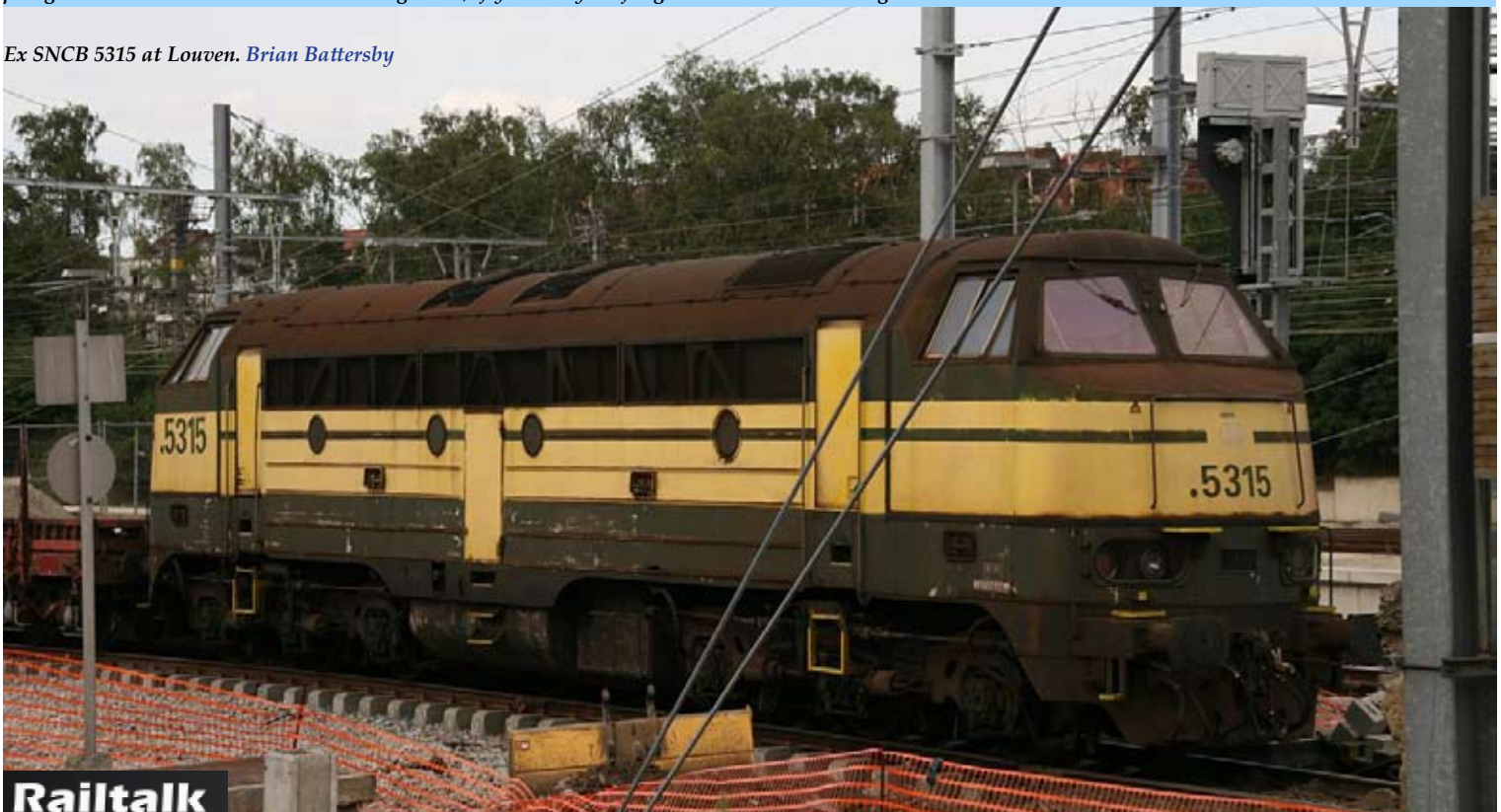
Ex SNCB 5315 at Louven. Brian Battersby