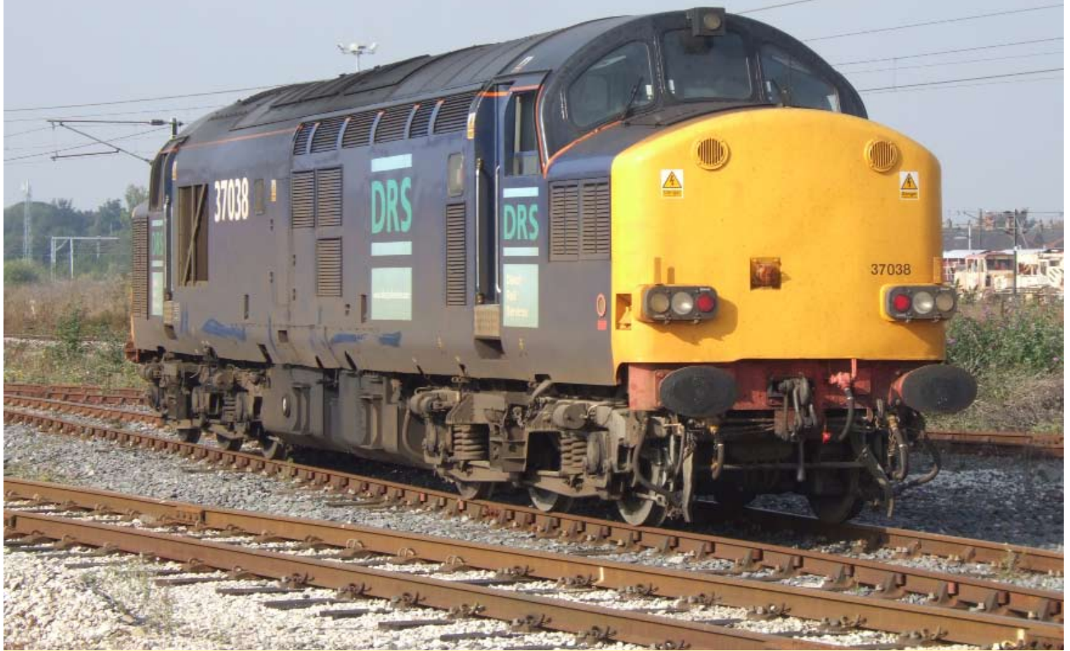
Above: Standby loco for most of October was 37038, seen here at York, on the 7th Oct. Later in October it went to East Anglia to assist. Andy Below: Veteran Class 20 but still going strong on the 6th Oct is 20304 with the early morning trip from York along the Scarborough branch. Class47