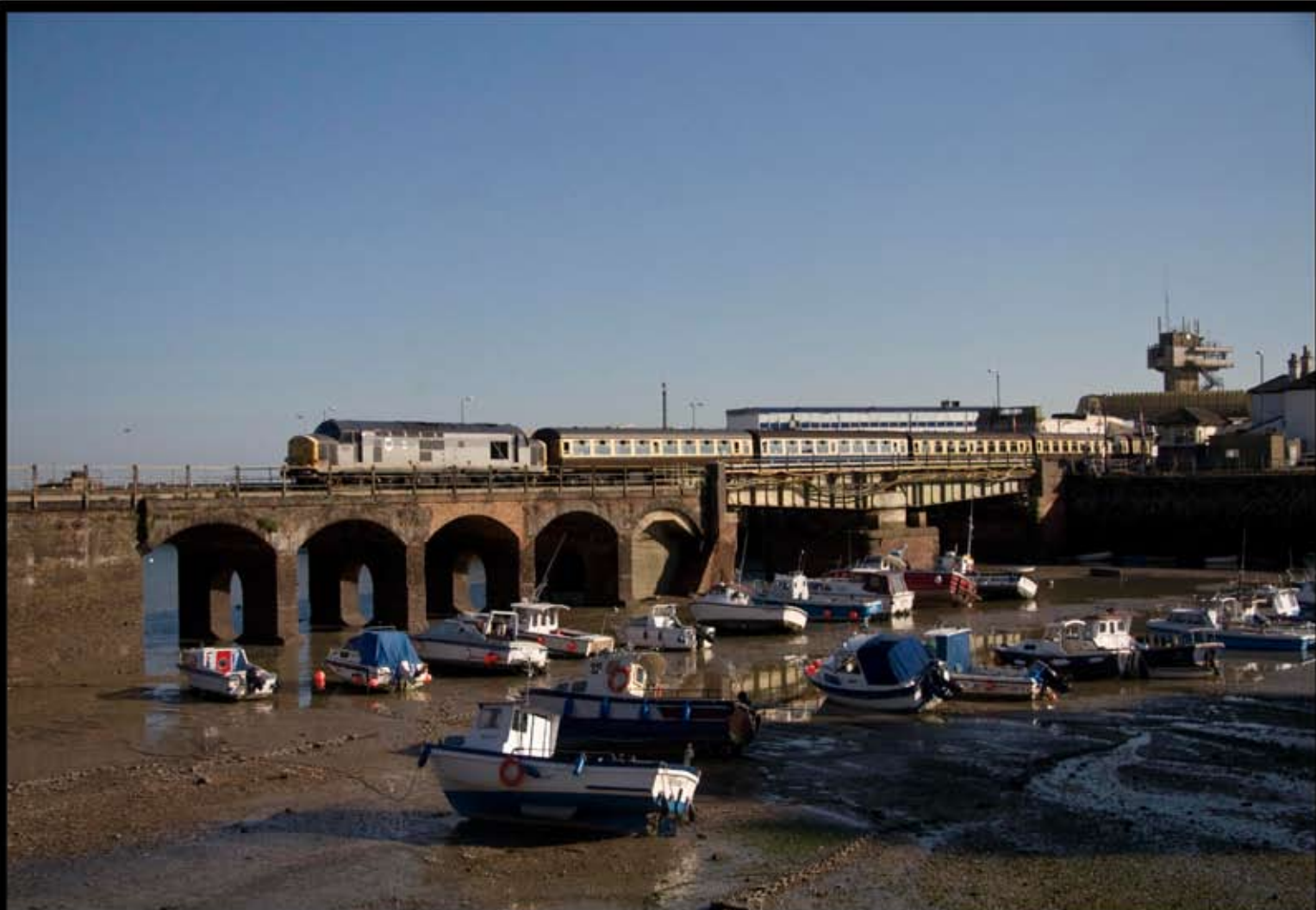
Above 37601 crosses Folkstone Harbour with an array of different boats in the foreground whilst working the Atomic Harbourmaster that ran from Crewe - Kensington Olympia and return via the Dungeness branch on the south east coast. Andy Patten