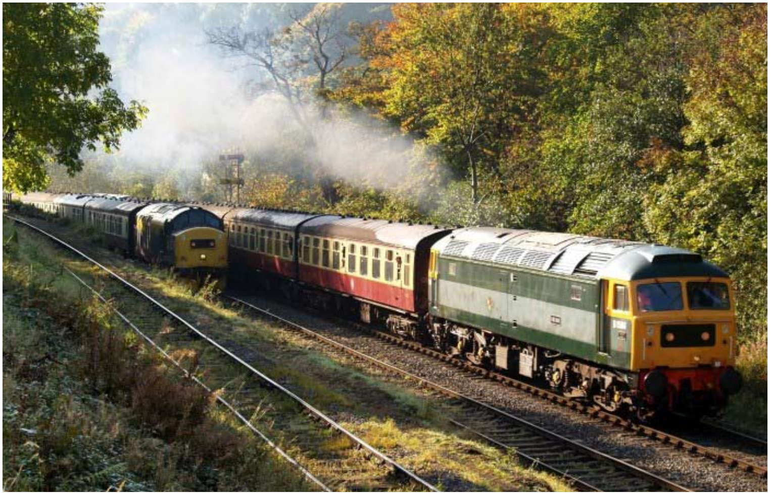
Above: Two more from the Llangollen Autumn Diesel Gala and here Class 47 D1566 seen passing 37240. Below: D5401 was a popular visitor to the line and is seen here with the freight leaving Glyndyfrdwy.