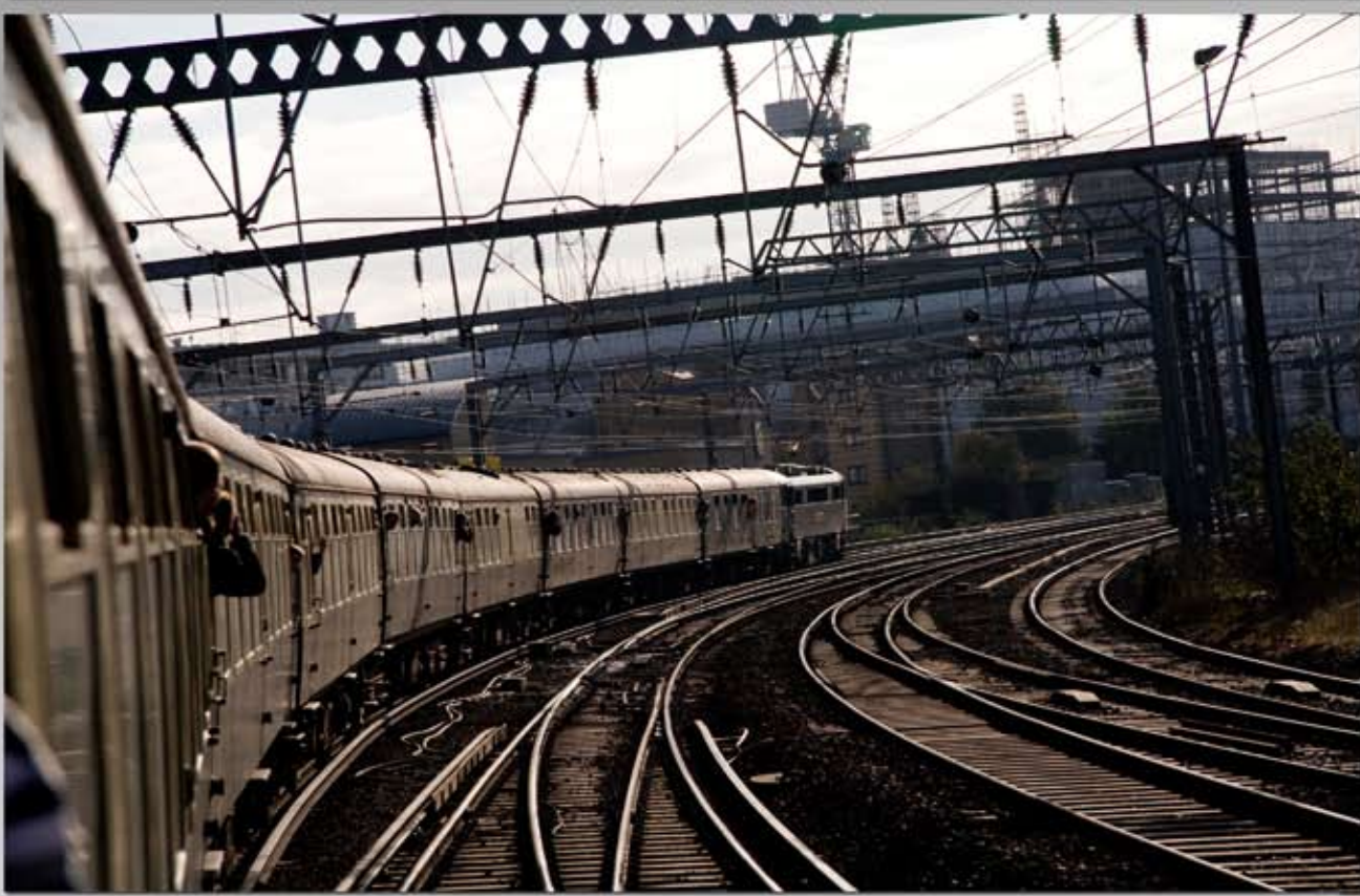
Left 86101 pulls the first leg of the Atomic Harbourmaster tour from Crewe into Euston. The tour would then continue onto Folkestone Harbour and Dungeness 86101 is seen working on WCML metals on 20/10/07