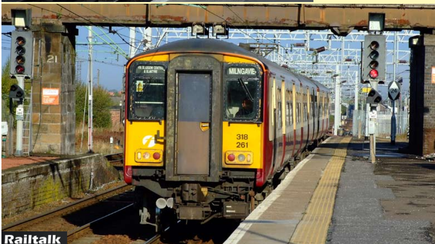
Bottom: In autumn sunlight, and a lovely blue sky, Class 318 261 works the 09.53 2F27 Lanark - Milngavie coming into Motherwell on the 10th October.