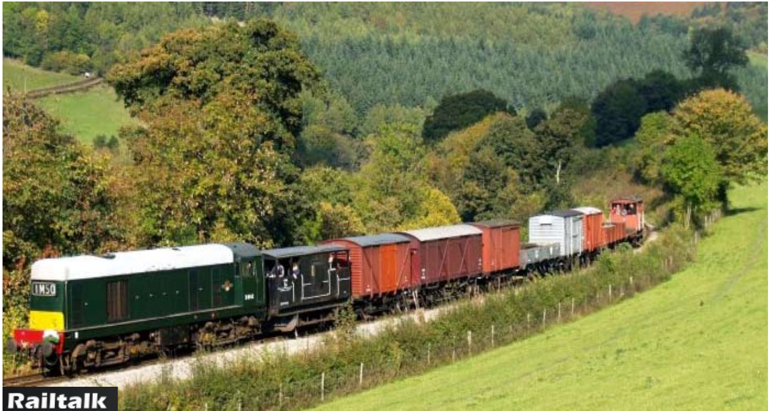
Below: The Llangollen also had various locos taking a freight with passengers in the guards van, along the line.