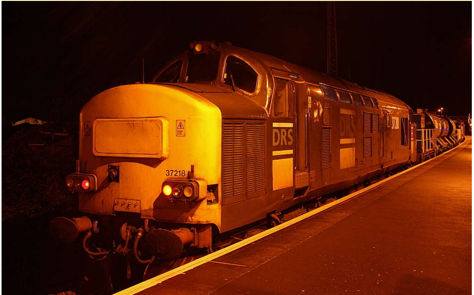
Above: Whilst the Class 20's dominate the North East RHTT's, Class 37's are the main power for the mid Wales diagrams. Here is 37218 on the front of the departure from Welshpool on the 3rd October. Below: Such is the diversity of traction on the RHTT's that there are not many loco types that have never assisted, and this year is no exception. This year, EWS have the contract for services out of Peterborough and here we see 67016 returning with the morning turn.