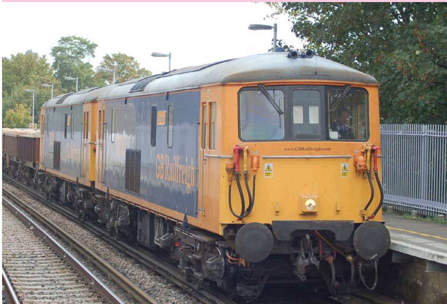
Above: GBRF 73205 and 73209 at Lewisham on a Engineers train.