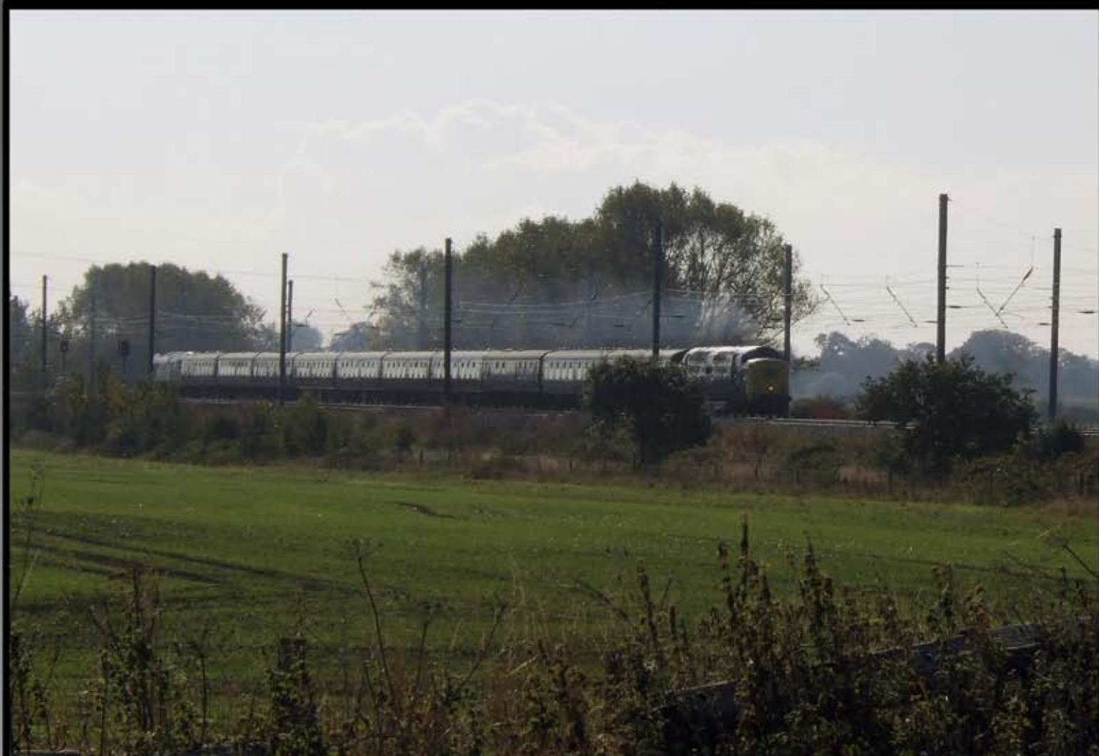
Above 55022 passes Skelton with the Autumn Highlander railtour. It is pictured here, working the same railtour that a year earlier cause big engine problems for the loco