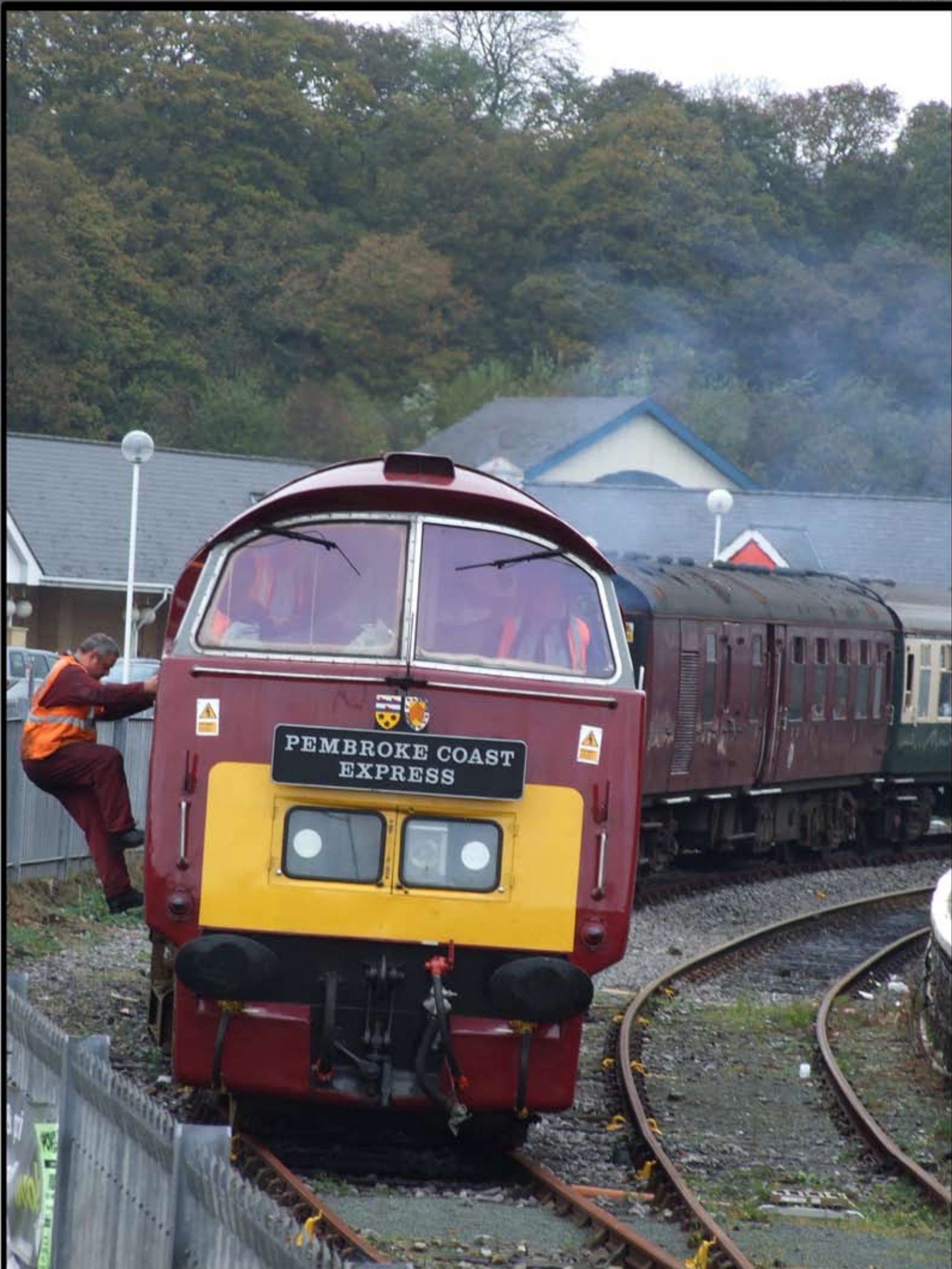
Above D1015 prepares to start up at Milford Haven ready to head the return run to Paddington on the Western Refiner railtour. Of note, the railtour was diverted away from Bristol Parkway through Filton Abbey Wood and Bath due to vandalism of signal cables. Jim