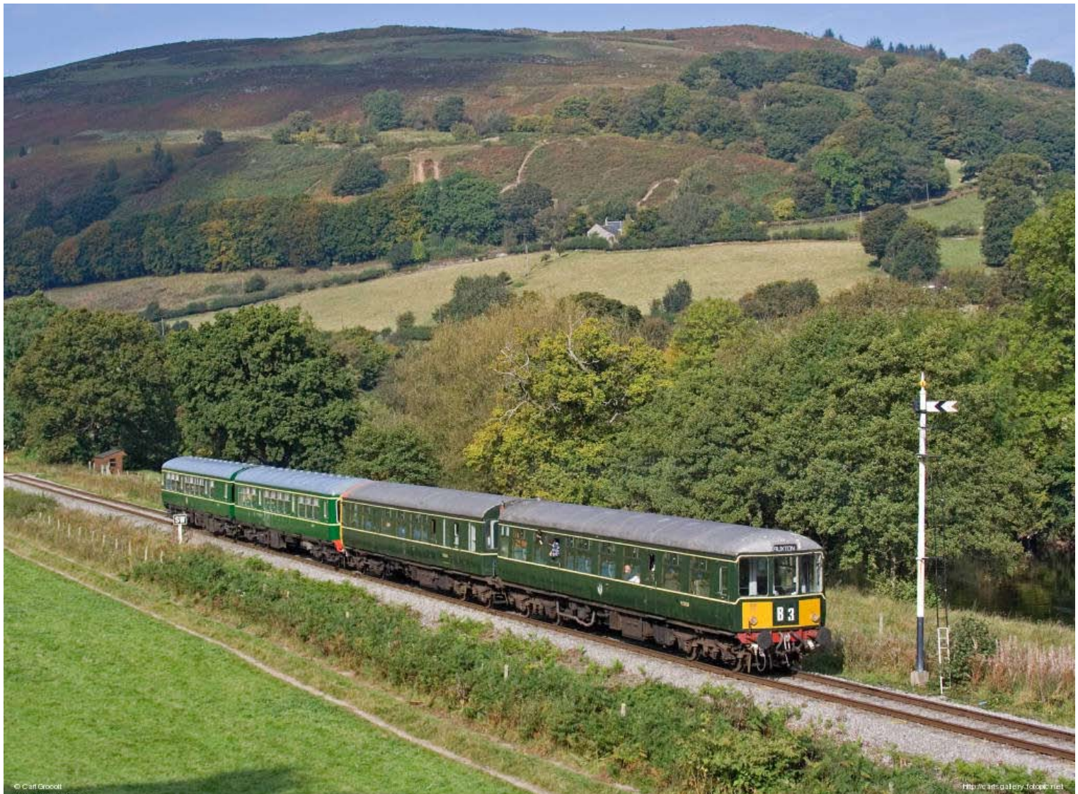
Above: The splendour that is the Llangollen railway, provides a backdrop to this service that could easily be from many years ago, the colours in the trees and on the hillside make this a very good picture. Carl Grocott