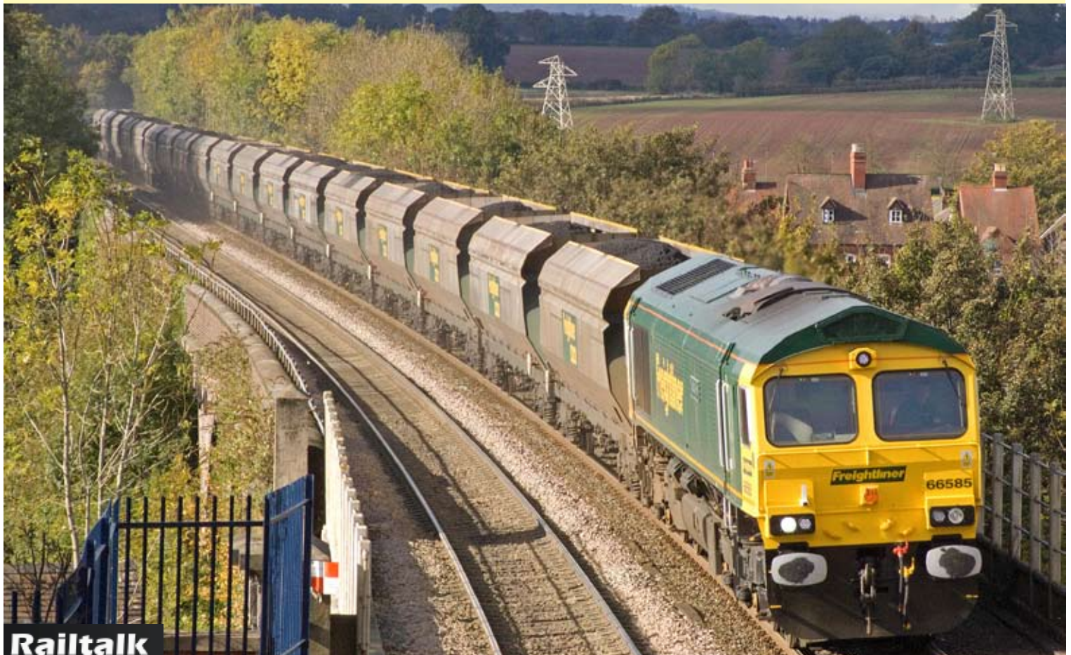
Below: 66585 works the 6Z82 Portbury - Rugeley seen here passing Shifnal on the 17th October.