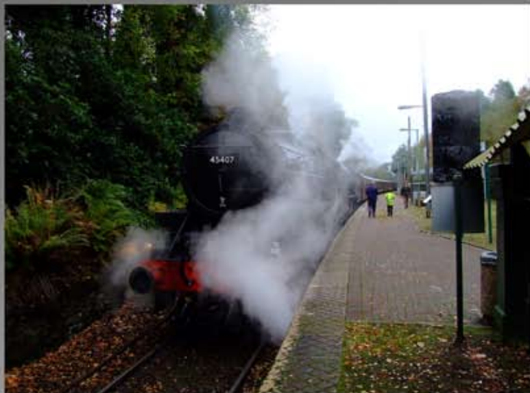
Above LMS Class 5MT 4-6-0 no 45407 + LNE K1 Class 2-6-0 no 62005 at Helensborough station working an ECS from Fort William - Carnforth

Welcome to the second issue of Charter Scene, as part of Railtalk Magazine. Charter Scene aims to document charter movements during the month, although we need your help. If you have any images or accounts you would like included please contact us via the usual address.