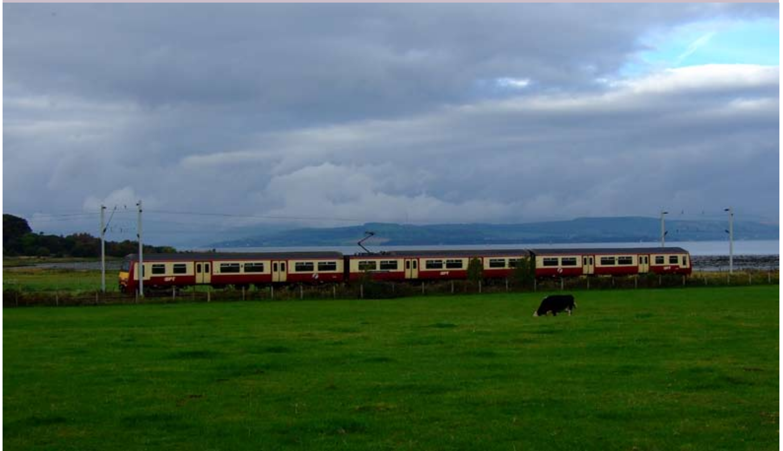
Above: Does the cow care? Not so much as a different view, but wow what a view!.320322 passes Ardmore. Below: A splendid night time exposure as a Class 175 rounds the curve at Sherwisbury with a Manchester - Crdiffe service.