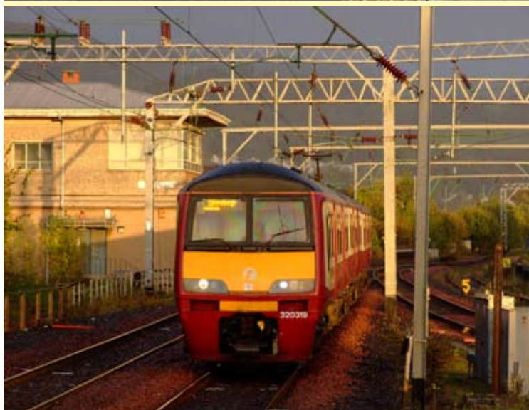
Middle: Class 320 319 17.15 1H35 Bellgrove - Helensburgh C. approaches Dumbarton. 16th October.