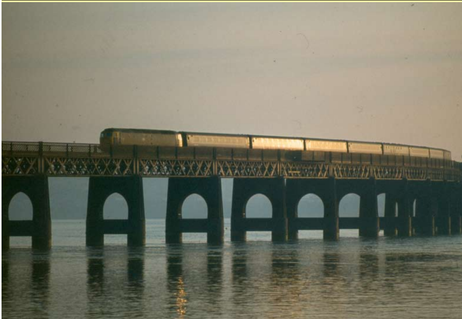
Above: 22nd Dec 1979, and 47431 crosses The Tay Bridge on the 05.50 Kings_Cross - Aberdeen. David Mead Below: 21st July 1967 - Standard Class 4 75033 at Carnforth Motive Power Depot - behind is 9F 92016. David Mead