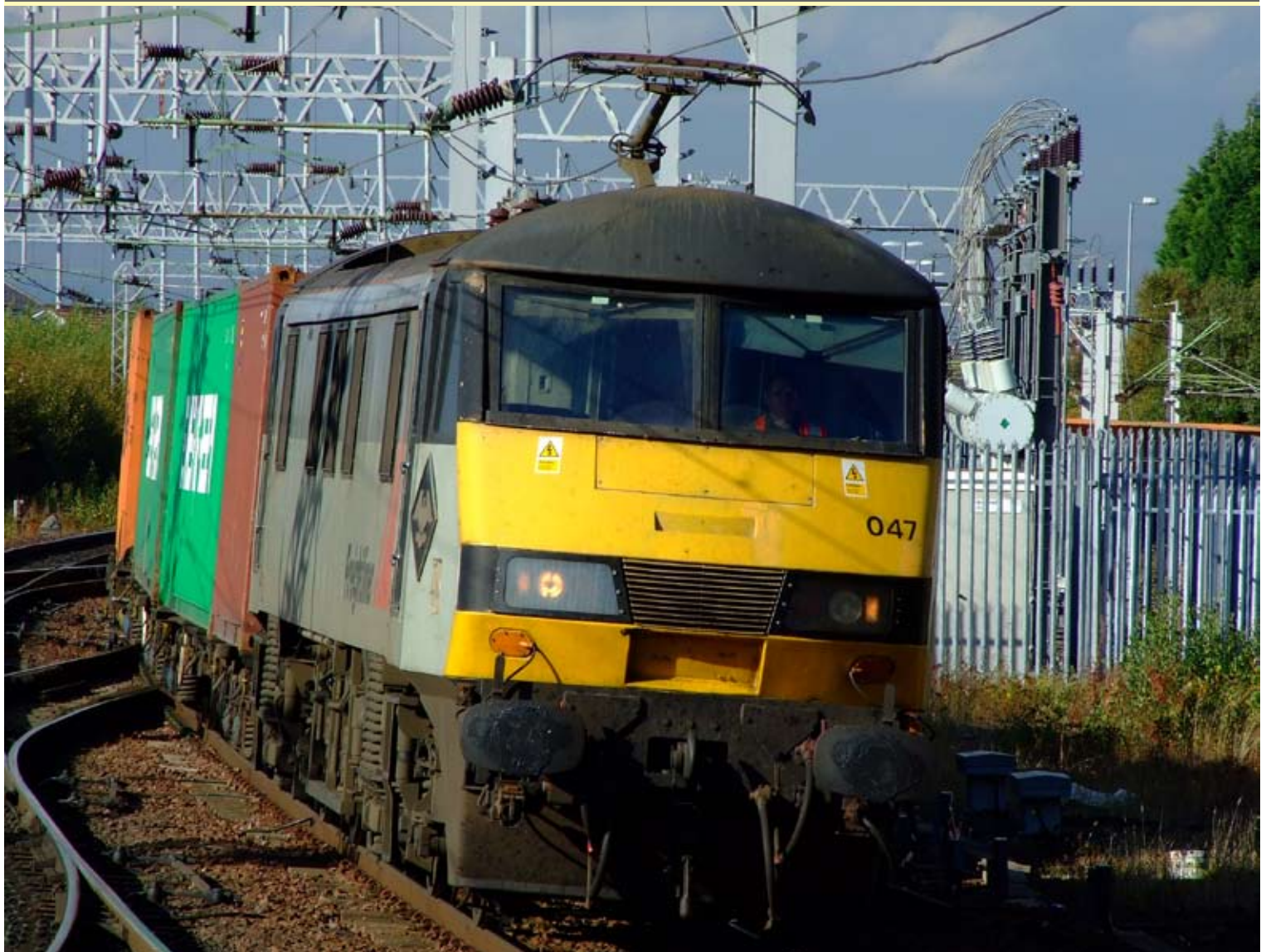
Above: Class 90 047 works the 13.52 4M74 Coatbridge F.L.T. - Crewe Basford Hall Freightliner approaching Motherwell on 10th October. Jonathan McGurk Below: Newly delivered 66 429 passes Motherwell working the 06.31 4S43 Daventry - Grangemouth Tesco Express train 10th Oct. Jonathan McGurk