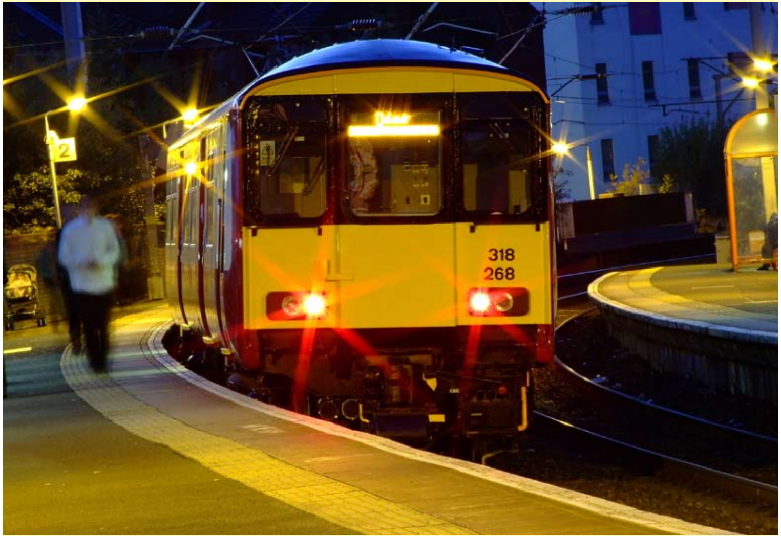
Above: Class 318 268 just fresh from refurbishment from Hunslet-Barclay is seen working the 18.37 2L03 Larkhall - Dalmuir Service 4th Oct. Below: Class 158770 still shows its former Northern Spirit identity as it works a service from Nottingham, seen here at Grantham 6th Oct.