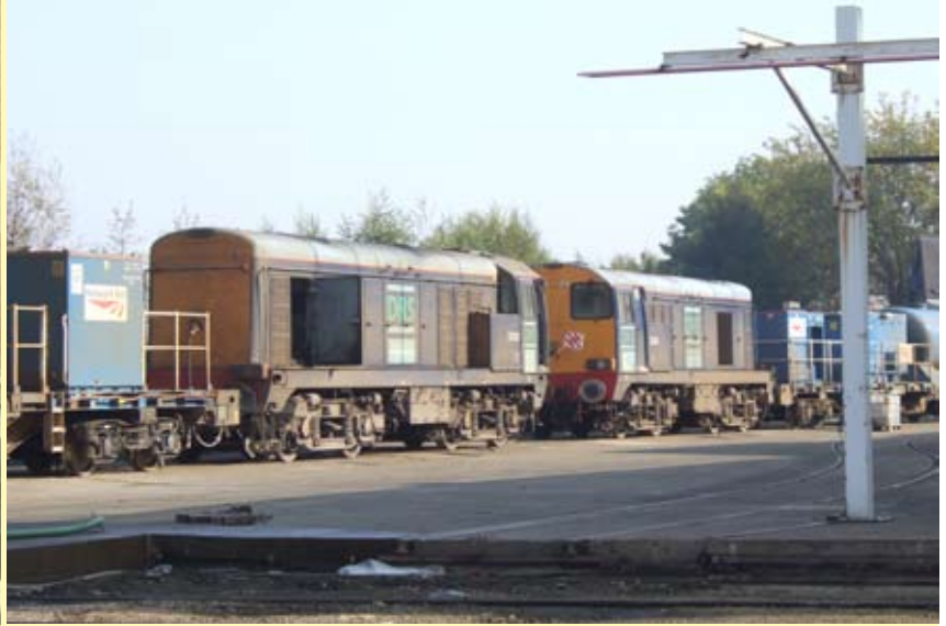
Above left: Undergoing attention at DRS's York Works base on the 7th October is 20301. There are normally five Class 20's 20301 - 20305 allocated to York. Andy Top right: M.P.V.s DR 98919 + DR 98969 Approaching Dumbarton Central Station working the 15.39 3S91 Shettleston P.T. - Dumbarton Central Sandite Train. Middle right: Class 20's 20302 and 20304 have routine maintenance undertaken at York works on the 7th October. Below: Ex EPS machine 37602, now working for DRS is seen at Shrewsbury on the 18th October.