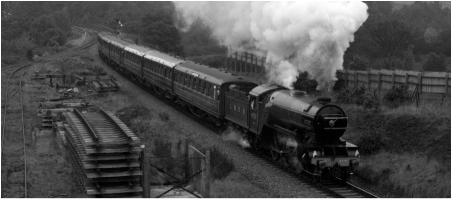
Above: Green Arrow was probably one of the few locos to appear at the Severn Valleys steam and diesel gala.