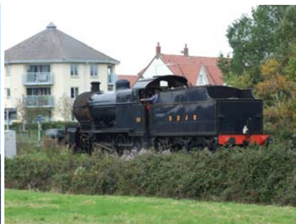
A selection on shots, all taken at the recent West Somerset Railway's Gala, on the 7th October.