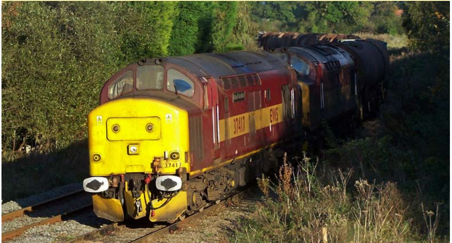
Above: 37417 and 37410 at Hartford Junction on 19th October. This is a few miles south of Weaver Junction and is where the line from Northwich meets the WCML. The working is the 6F61 Folly Lane - Warrington which has started producing pairs of 37s due to the weight of the train making locos slip badly on the climb to Runcorn station. Mike Byrne